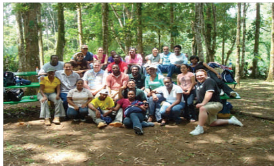
Participants at the IICA Young Leaders Forum, Costa Rica, March 2008

On November 5, 2008, Oxfam-Québec and IICA signed a Cooperation Agreement which is designed to increase the collaboration of the two organizations in technical capacity projects related to agriculture in LAC. IICA and Oxfam-Québec have similar institutional values and share a common vision: contribute to sustainable agriculture development, food safety and rural prosperity. Both organizations value the development of partnerships with local stakeholders and, the importance of education as a vehicle to stimulate economic and social development,