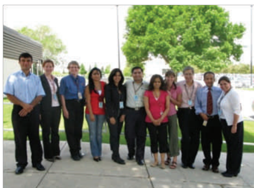
Participants at the FMD detection training at NFADC—Winnipeg, June 2008

IICA Canada was invited to formally support CFIA in the implementation of the Counterterrorism Capacity Building Project (CTCB). This project was approved and funded by the Canadian Government through DFAIT. The project focused on the transfer of laboratory diagnostic and epidemiology methodologies to enhance FMD preparedness and mitigation in South America. Other participants in the project were the PAHO, U.S. Department of Agriculture (USDA) and the University of Colorado.