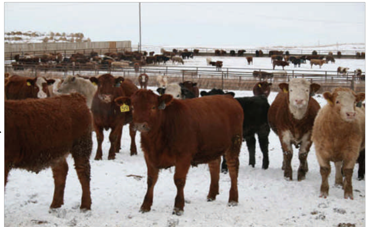
Highland Feeders, Alberta, December 2008