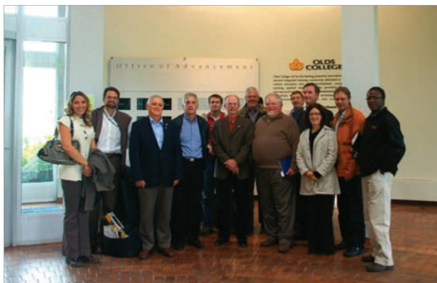
AACTI members and IICA representatives, Olds College, October