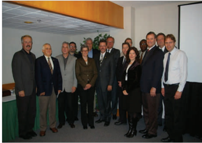
AACTI members, Alberta government officials and IICA representatives, Edmonton, October 2008